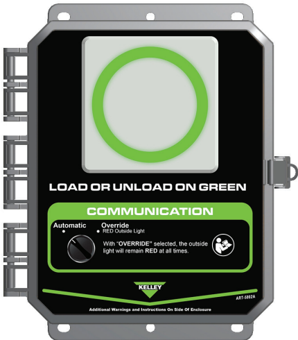
Automatic Light System (ALS) Auto Activation