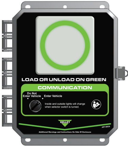
Manual Light System (MLS) Manual Activation